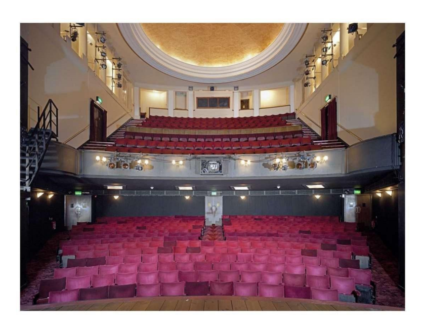
The Duchess Theatre has been home to The Play That Goes Wrong for 10 years.